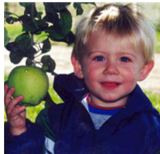
Berrien County has a diversified economic base with its manufacturing, agriculture, tourism, and service industries.